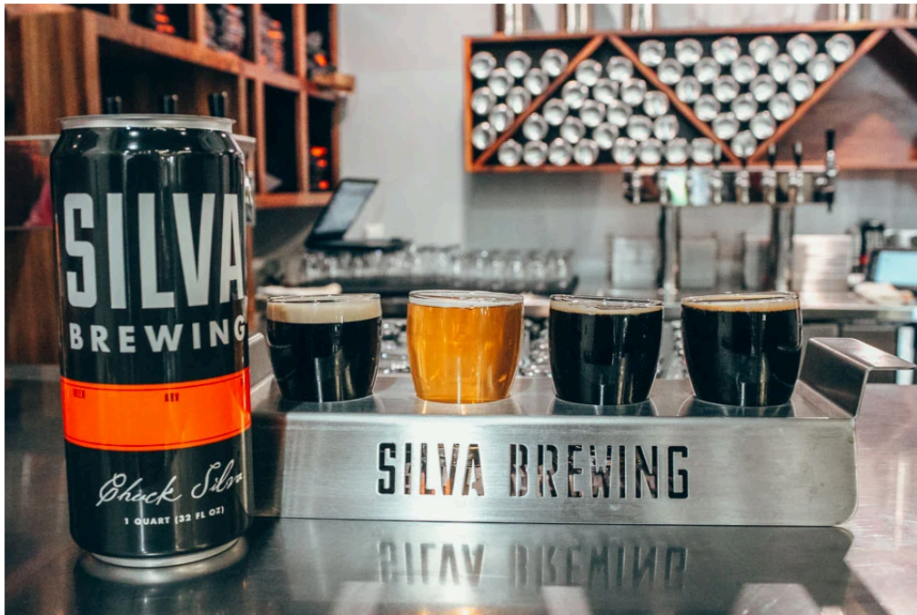
Silva Brewing is one of our favorite craft breweries in Paso Robles!